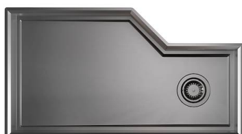
Sink Diade Gun Metal Fumè 3028 816